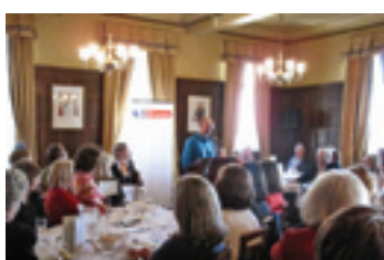
It was a capacity audience at the event, the first of a series of similar lunchtime functions for NZ Friends of the NZ-UK Link.