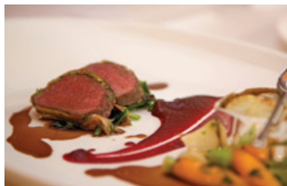
Just a sample from Luke's delicious award-winning three-course menu: loin of NZ venison, herb mousse with beetroot purée, venison hot pot, glazed young vegetables and a shallot and port jus.