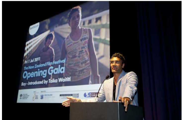
Taika Waiti, director of popular NZ movie Boy, speaking at the opening of the festival.