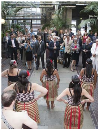
Ngati Rahaga, the London Maori cultural group, performed at the festival opening in the Barbican conservatory.