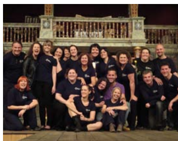
The cast of NZ teachers on stage at The Globe.