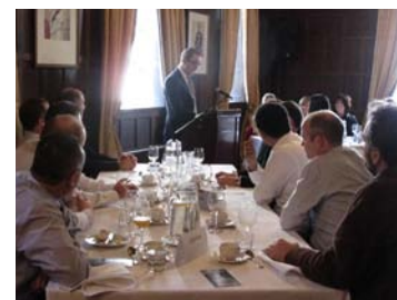
Listening intently are the guests on the HSBC table.

Patron: HRH The Princess Royal President: Dame Kiri Te Kanawa The NZ-UK Link Foundation (formerly the Waitangi Foundation) is a registered charity in the United Kingdom (Number 802457) and is registered in New Zealand as a charitable entity (Registration Number CC 36164).